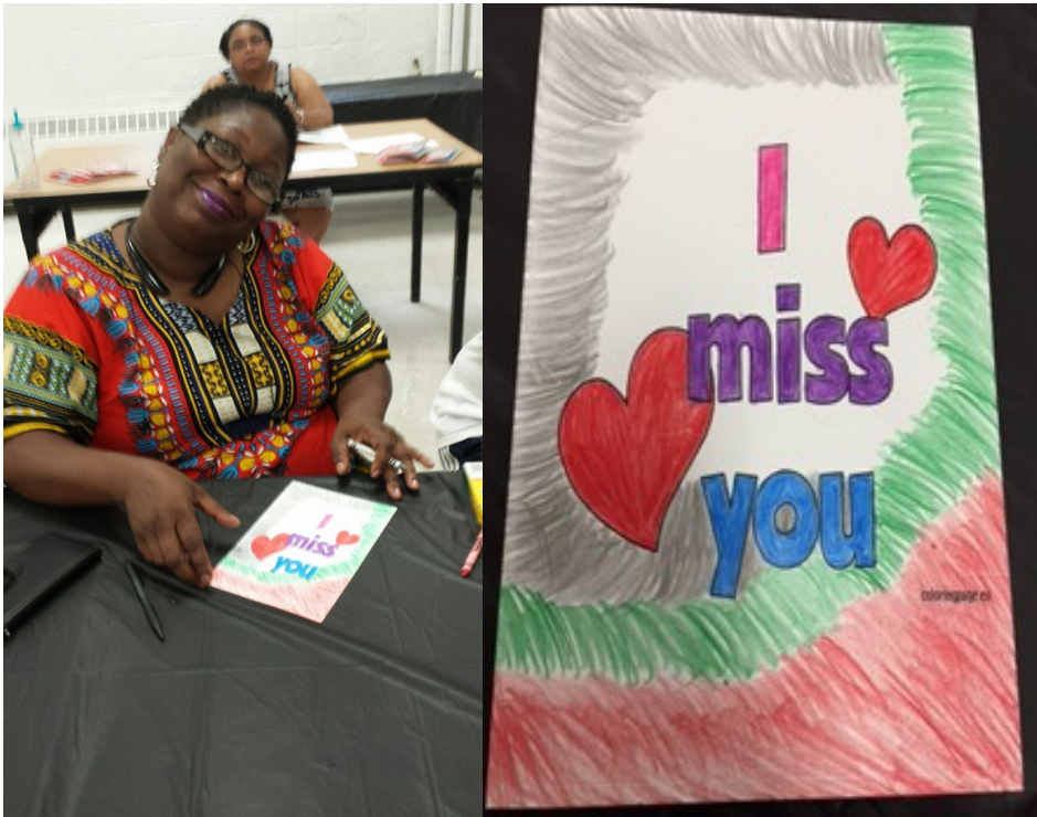
A parent colors a card for her son who is incarcerated in the FBOP