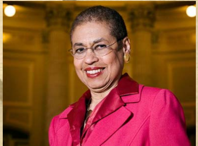
The Honorable Eleanor Holmes Norton The United States House of Representatives House Committee on Transportation and Infrastructure Representing the District of Columbia